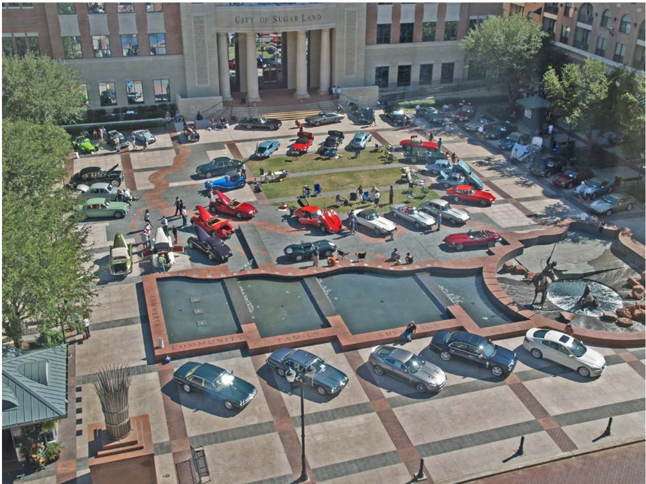
An impressive aerial view of the Concours site in Sugarland one sunny Saturday morning...