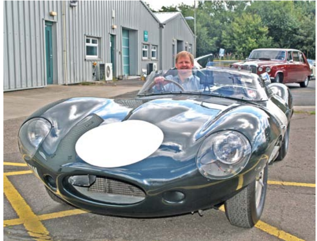
...and the real thing with yours truly smiling behind the wheel, courtesy of JDHT in Conventry/UK last year

The new "classics" are the XJS. Few Jaguars are subject to more discussions, but fact is that the XJS range represents an important part of Jaguar heritage, and no matter which car Jaguar built as the successor to the E-type, it was doomed to be a tough task. Also this year we had a great selection of XJS cars, from convertibles to coupes, including some new members' cars. Below is a selection of the increasing popular, yet deserving XJS