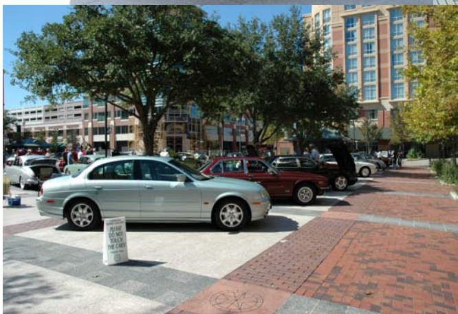
3 new Jaguars on display, courtesy of event main sponsor Momentum Jaguar